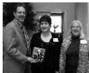
Special Project of the Year Category 2 – “Key Ingredients: America By Food” (The Georgia Tour) Georgia Humanities Council University of West Georgia