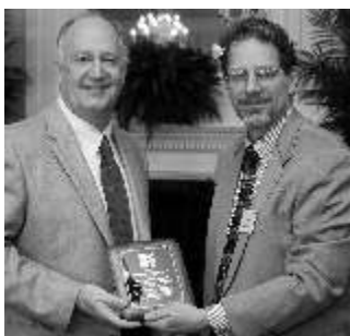
Museum Education Program of the Year Aviation Outreach Museum of Aviation Flight & Technology Ctr.