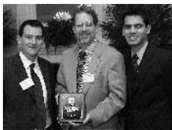
Corporation of the Year Delta Air Lines, Inc.