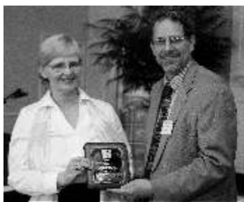
Museum Exhibition of the Year Category 2 – “Paper Runway” American Museum of Papermaking/ Hartsfield-Jackson Int. Airport