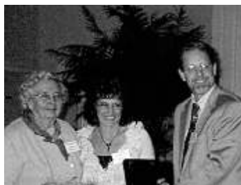
Museum Exhibition of the Year Category 1 – “Wheels of Change” Legacy Museum on Main