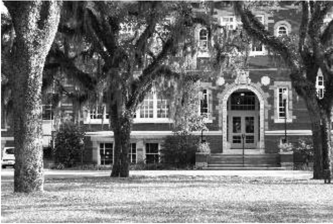
Thomasville Cultural Center

The weather matched the warmth of the welcome GAMG members received in Thomasville in January for the annual conference. Attendees enjoyed visiting Thomas County's cultural and historic sites, dining on locally produced foods, and attending excellent sessions geared toward "Keeping the Faith."