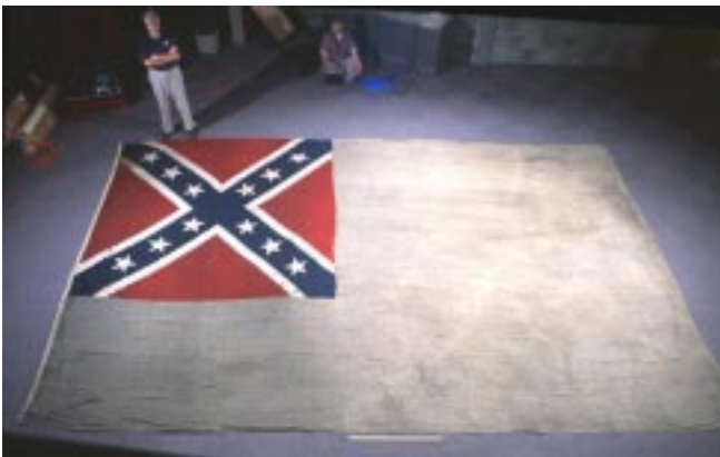
The largest flag in the collection is a 16 x 24 foot piece that came from the CSS Atlanta.

One of the nation's most significant collections of Civil War navy flags was returned to the south by the Massachusetts Historical Society. The Port Columbus National Civil War Naval Museum in Columbus received the seven rare flags on May 21.